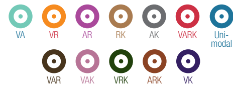
Figure 2: Percentage of students with six combinations of bi-modal, and four combinations of tri-modal learning preferences (n=140). Key: V= visual, A= auditory, R= read/write, and K= kinesthetic.

uni-modal learners. The remaining 65% preferred using either two (14%), three (19%), or four (32%) modes to assimilate information and were designated multi-modal learners. The majority of these learners used all four modes equally (quad-modal), while the rest preferred using three (tri-modal) or two (bi-modal) modes for acquiring knowledge [Figure 1]. Bi-modal and tri-modal learners preferred six and four possible learning preference combinations, respectively, and the kinesthetic style was preferred for use in combination with other modes [Figure 2].