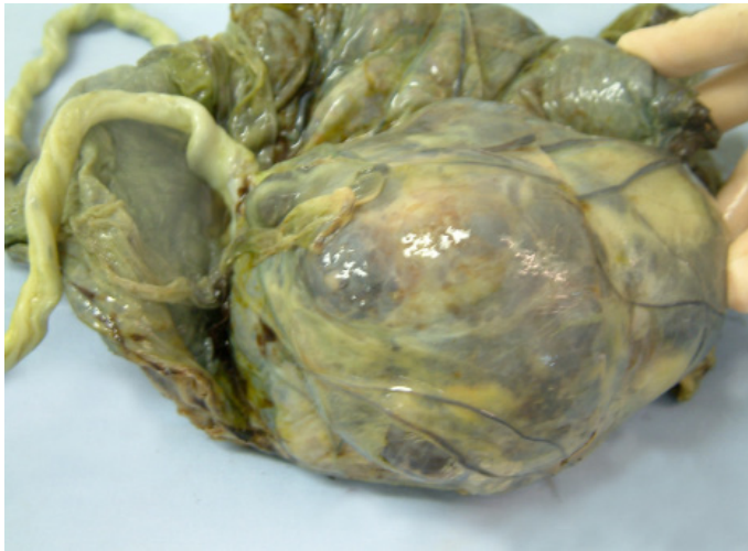
Figure 1: Placental disc with the bosselated brownish mass on the fetal surface.

19×18×3cm, umbilical cord measuring 55cm in length and fetal membranes. The placenta had a smooth, brownish bosselated mass measuring 13×12×6cm centrally close to the cord insertion on the fetal surface. (Figure 1) The mass comprised solid nodular brownish areas and blood filled spongy areas separated by bands of fibrous tissue. (Figure 2) Histology confirmed a chorangioma with areas of ischaemic necrosis. (Figure 3)