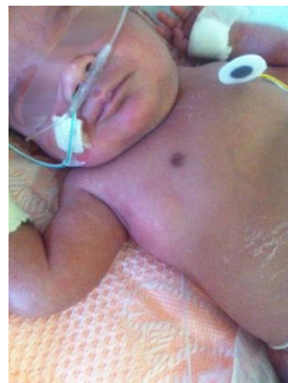
Figure 1: Large, erythematous, indurated, smooth swelling on the right axilla of the neonate on day 5 of life.

During the first 24 hours of life, he required inotropic support because of hemodynamic instability. He had two episodes of hypoglycemia that required two boluses of 10% dextrose. In view of suspected sepsis, a septic workup was done and antibiotics were started. He was ventilated with minimal settings for two days then he was extubated. On his 5 th day of life, he developed bilateral symmetrical axillary swellings (Fig. 1), tender on touch, lobulated and measuring 3 × 3 cm. The overlying skin was normal with no redness or draining sinus. Ampicillin was changed to cloxacillin, and cefotaxime was continued after consulting pediatric surgeons. Further workup was done because the swellings were increasing rapidly in size including screening for CMV, TORCH, syphilis, HIV, which all reported as negative.