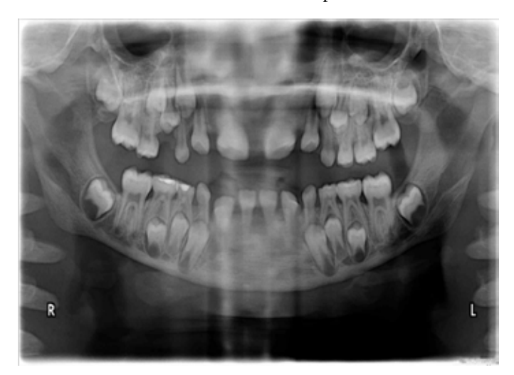
Figure 6: Orthopantamograph of the patient showing multiple impacted teeth.

Severe hypothyroidism, such as in the present case, can have deleterious effects on tooth development and eruption, and lead to prolonged retention of the primary dentition, subnormal growth of the maxilla and mandible with a marked reduction in the dimensions of the facial complex, and a lack of coordination between mandibular growth and dental development. <sup>10,17</sup> The initial radiographic films of the patient including the cephalometric indicate that the growth of the mandible and the maxilla was severely impaired. The effect on the dentition was, to a great extent, limited to failure to exfoliate the primary teeth, delayed eruption of permanent teeth and distortion of the roots of the lateral incisors and first permanent molars.