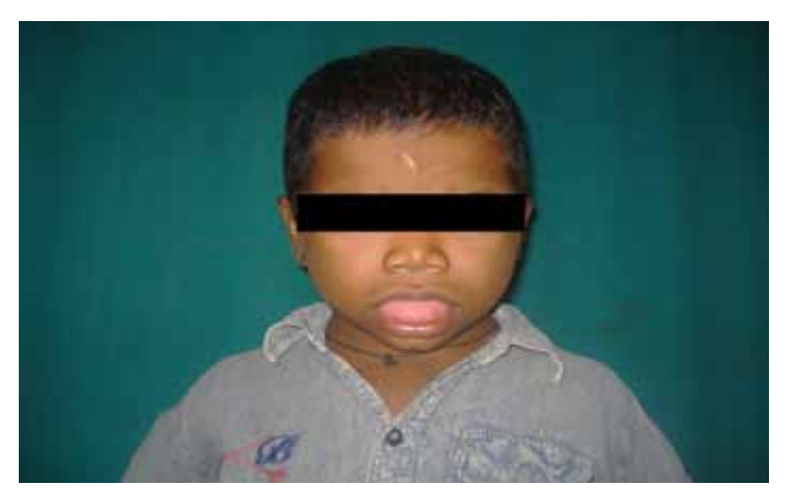
Figure 3: Extra oral photograph of the patient showing facial features.