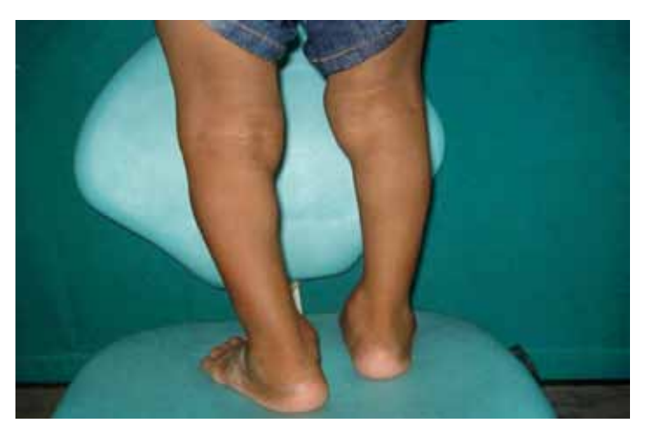
Figure 2: Photograph of the patients limbs showing prominent calf muscles.

with the short stature (103) and upper/lower segment ratio of 1.5, rough hair texture, broad forehead with thick skin, coarse facial features, depressed nasal bridge, hypertelorism, and puffed lips (Fig. 3). TMJ and lymph node examination was unremarkable. Intra oral examination revealed that the patient had high arched palate and a protruding tongue (Fig. 4). Hard tissue examination revealed mixed dentition with permanent incisors, deciduous canines and molars in each quadrant. Teeth were conical in shape and deep carious lesion was present in relation to 54, 74, 75 and 85. The teeth in relation to 22 and 12 were congenitally missing. Based on these features, a clinical diagnosis of skeletal and dental malocclusion (class II) secondary to hypothyroidism was made.