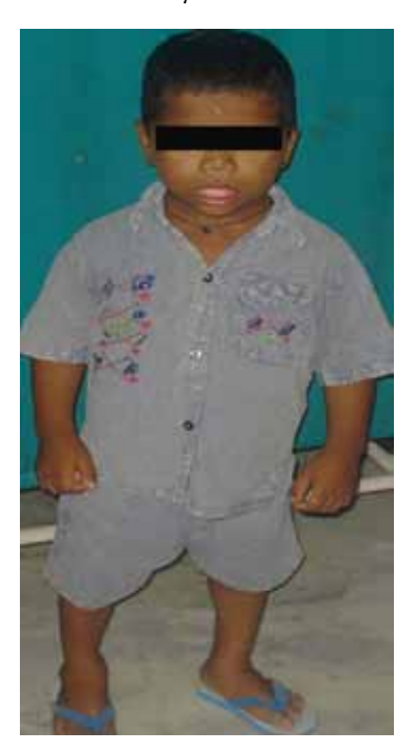
Figure 1: Profile photograph of the patient showing short stature.

An 11-year-old boy (Fig.1), with severe congenital hypothyroidism was referred to the Department of Oral Medicine and Radiology from the Pediatrics Department, Rohilkhand Medical College, Bareilly (UP), for dental evaluation. The patient gave a history of reduced appetite, chronic constipation with hard stools, cold intolerance, delayed response to verbal commands and visual stimuli, since birth. The patient started speaking at 5 years of age and could only speak a few words. His family history revealed that he was the eldest son among two siblings; his younger brother passed away in an accident when he was two years old.