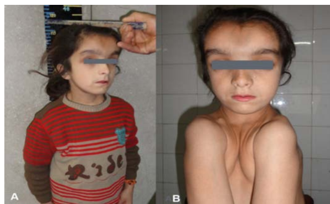
Figure 1: A) Severe short stature (height: 118 cm); B) Extreme hyperadduction of shoulders almost approximated in midline.

had no significant perinatal history and had normal developmental and mental milestones. On examination, the patient had severe disproportionate short stature with height of 118 cm (height SDS of -4.06), upper segment to lower segment ratio of 1.03 (Fig. 1), head circumference was 53 cm, weight of 18 kg, and BMI of 13.1 kg/m 2 . The patient was prepubertal. There was frontal and parietal bossing, open anterior fontanelle, hypertelorism, depressed nasal bridge, high arched palate, supernumerary teeth, and clinodactyly. She also had bilaterally absent clavicles, bilaterally hypermobile shoulders which could be approximated in the midline, (Fig. 1). Cardiovascular, respiratory, abdominal, and central nervous system examination was unrevealing. The patient had two more siblings who had normal height percentiles and no skeletal abnormality.