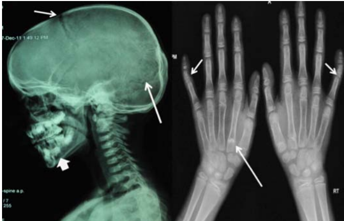
Figure 2: A) X-ray skull lateral view showing open anterior fontanella (short arrow), open cranial sutures (long arrow), frontal and parietal bossing and supernumerary teeth (arrow head); B) X-ray both hands AP view showing normal bone age and bilateral clinodactyly (short arrow), small 2 nd and 5 th middle phalanx, proximal epiphyses of 2 nd metacarpal bilaterally (long arrow).

teeth and malocclusion of teeth, (Fig. 2). X-ray chest revealed bilateral absent clavicles and X-ray pelvis showed wide open pubic symphysis, (Fig. 3). The differential diagnosis in this patient included hypothyroidism, rickets, pyknodysostosis, hypophosphatesia, osteogenesis imperfecta, Russell-Silver syndrome, Down's syndrome, and Apert syndrome. These were easily ruled out due to the presence of classical features of CCD and normal hormonal, biochemical, echocardiographic and ultrasonographic results, in addition to the presence of normal IQ.