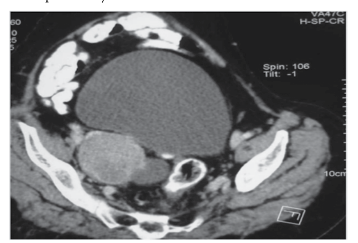
Figure 2: CECT Abdomen showing solid cystic lesion in right adnexa measuring 5.2 \times 5.6 cm.