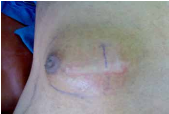
Figure 1: Dermatofibrosarcoma Protuberans (recurrence male breast).