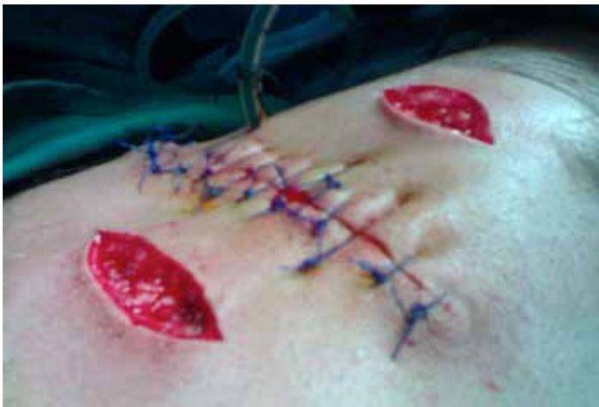
Figure 2: Up and down stab incision to release tension on skin.