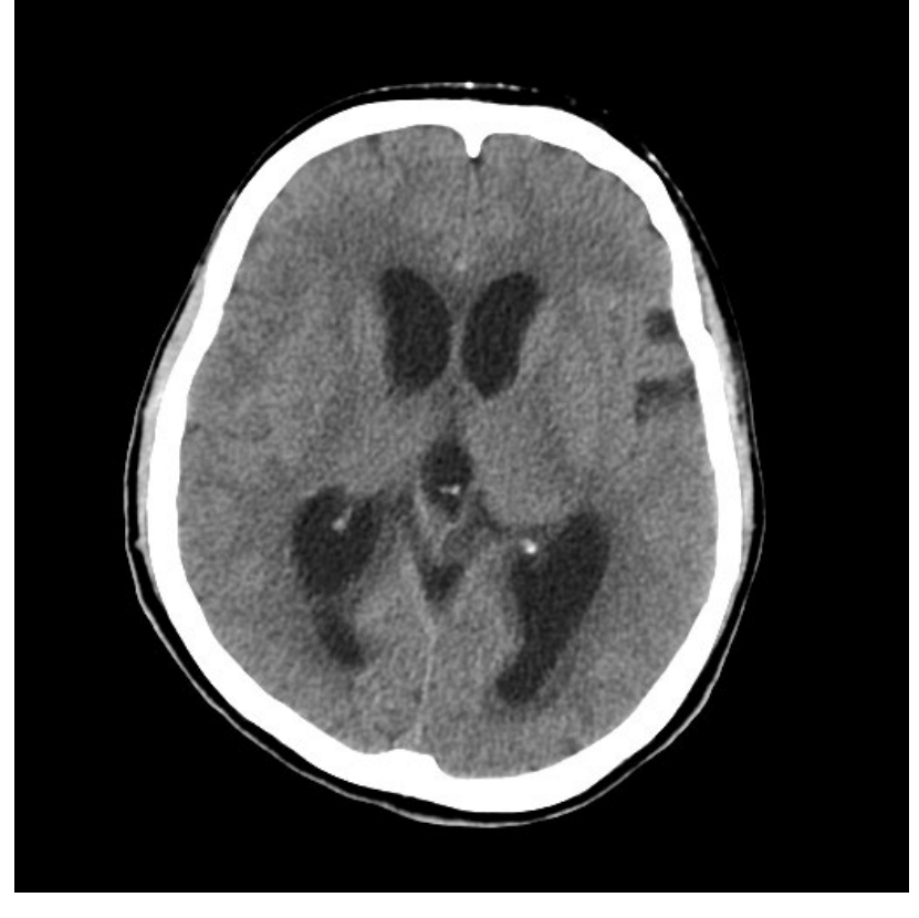
Figure 1: Unenhanced computed tomography of brain shows dilated bilateral lateral, third and fourth ventricles.