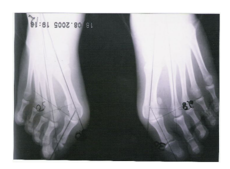
Fig 3: Pre and post operative X-rays

The lateral release releases the sesamoids from the head of the metatarsals so that after displacement osteotomy it lies in correct position above the sesamoids. The lateral sesamoid attachment to the adductor is not released and the inter metatarsal ligament is undisturbed. The phalangeal insertional band of the sesamoid is released. The lateral capsule is released with multiple punctures with a number 11 blade. The release is done through a small lateral intermetatarsal approach. In addition to the phalangeal insertional band, the metatarsal sesamoid suspensory ligament is cut, taking care not to damage the lateral blood supply to the plantar head. The adductor tendon is not detached from the lateral sesamoid in this approach.