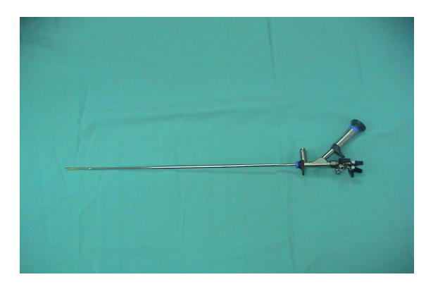
Figure 1: Semirigid Ureteroscope