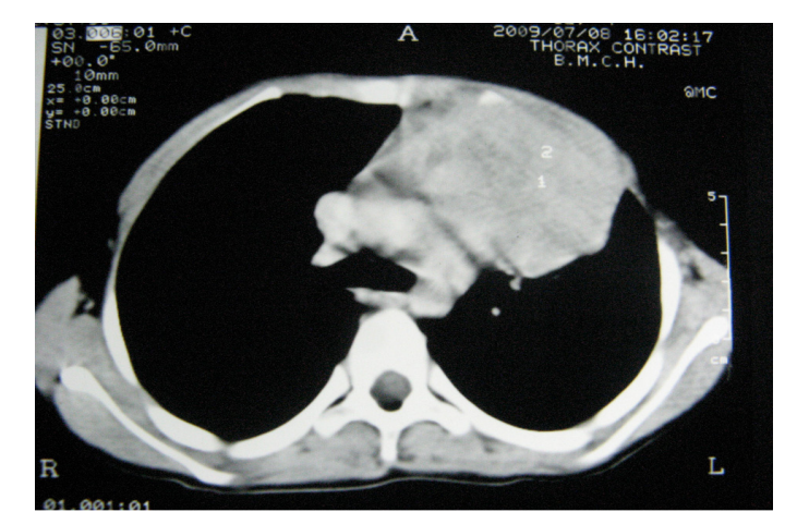
Figure 2: CT scan of thorax

She underwent left lung upper lobectomy and the tumour measured to be 14 x 9 x 5 cm in size was removed. Histopathological examination of the lung tumor (figure 3) showed sheets and nests of epithelial cells separated by stroma rich in plasma cells and lymphocytes that also extend into the tumor aggregates involving the overlying pleura. The bronchial cut margin was free of lesion.