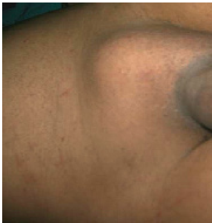
Figure 1: Swell in Right Groin

On local examination, a globular, soft, tender swelling measuring 5×2.3×1 centimeter, with negative cough impulse was present in the right inguinal region (Fig. 1).