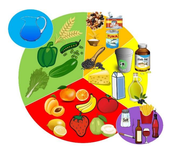
Supplementary Figure 9: Dyslipidemia and Heart Failure MyPlate.