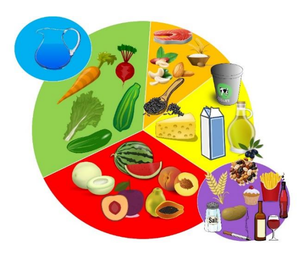
Supplementary Figure 6: Dyslipidemia and Pancreatitis MyPlate.