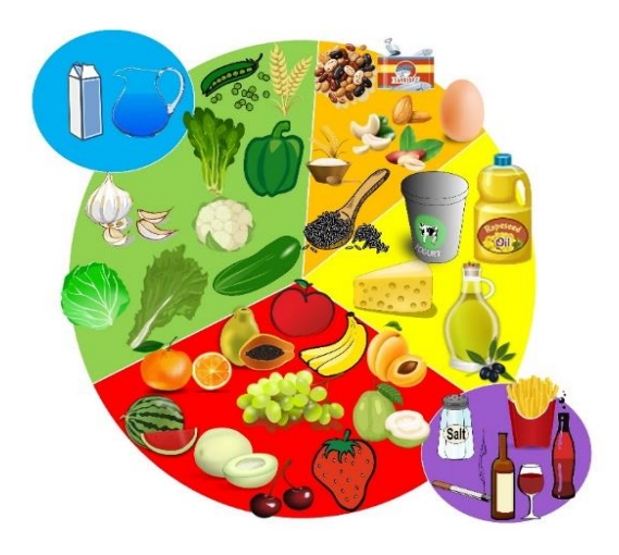
Supplementary Figure 7: Dyslipidemia and Metabolic Syndrome MyPlate.