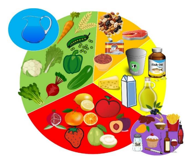
Supplementary Figure 5: Dyslipidemia and metabolic dysfunction-associated steatotic liver disease MyPlate.