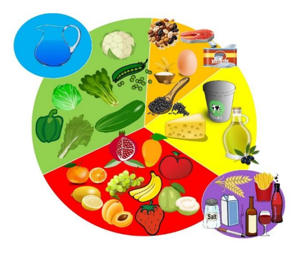
Supplementary Figure 8: Dyslipidemia and Thyroid Disease MyPlate.