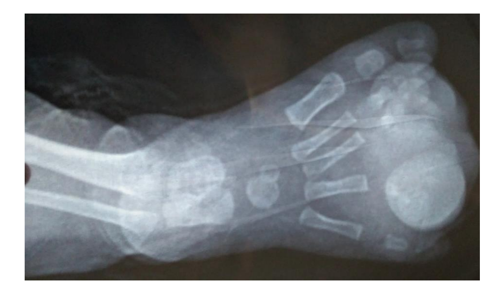
Figure 2: Xray of the foot showing shadow of the lesions, leading to splaying of the digits. Subtle phleboliths are appreciable in the distal foot.