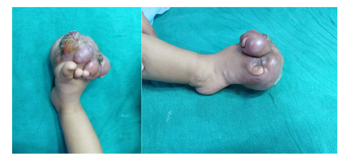
Figure 1: Reddish-purple mass in the distal half of the right foot

A 4-month-old male child was brought to the out-patient department of our tertiary-care hospital with a swelling in the right foot, which was noted since the day of birth. It was increasing in size and had bled profusely a month ago, which was managed with compression. On examination, a single non-pulsatile, well-defined reddish-purple lobulated mass of size 7.2 x 7.8 cm was noted in the distal half of the right foot, involving the plantar side of the fore foot and mid-foot. There was a healed ulcer on the ventral aspect of the lesion. The 3<sup>rd</sup>, 4<sup>th</sup> and 5th toes were engulfed by the mass and grossly disfigured [Figure 1]. The mass had a variegated consistency, being firm in some areas and hard in the rest. The blood investigations of the child were normal, including hemoglobin and platelet count.