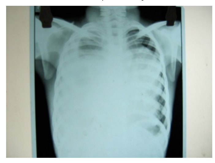
Figure 1: X - Ray chest showing mediastenal widening and right sided pleural effusion with shifting of trachea.

structures were detected in few of those cells. The CT scan findings along with biochemical parameters and cytological features suggested a mixed germ cell tumor predominantly composed of mature teratoma with areas of yolk sac component.